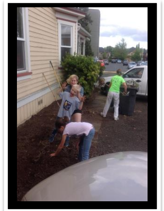
More UCC Work Party Fun as college students, adults, and children of all ages help out