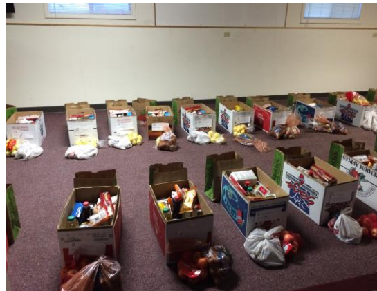
Packed Food Boxes, Thanksgiving 2015