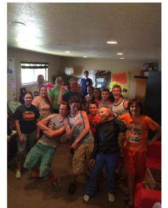
Clothing Drive, 2015

"They devoted themselves to the apostles' teaching and to fellowship , to the breaking of bread and to prayer ...All the believers were together and had everything in common. They sold property and possessions to give to anyone who had need. "